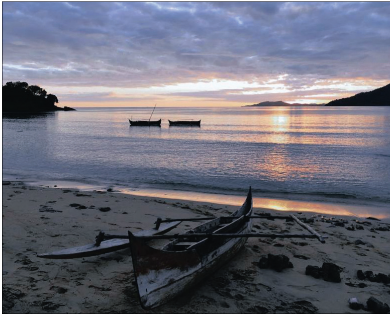
Sunsets are splendid on Nosy Komba island in Madagascar, while swimming and diving in the crystal waters are its simple joys.