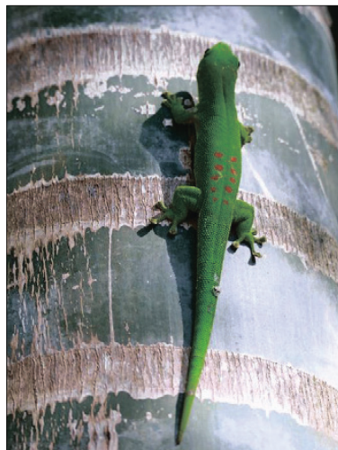
The tsatsaka lizard

“Paradise!” exclaimed another who spent some time on a fully crewed chartered yacht. I can see why.