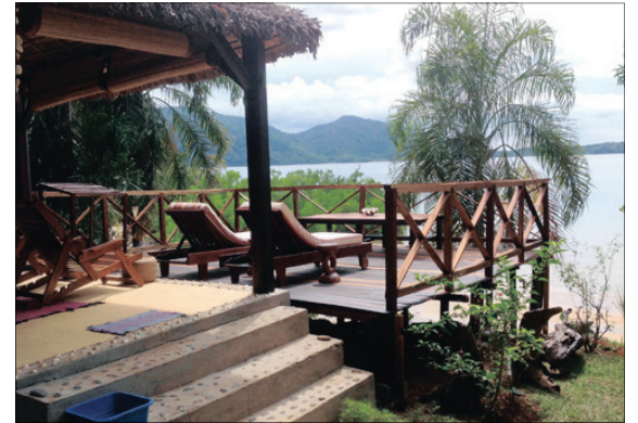
The idyllic view from the deck of the chalets.