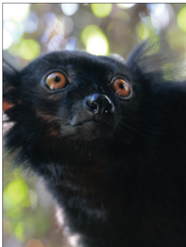
The black lemur

293 is a world away from my convenient, five-star stopover – D’Oreal Grande at Emperors Palace. No connecting flights on a Sunday necessitated this both ways – and what a pleasure. I’ve never been so rested and raring to go on arrival at an exotic destination – or on returning home.